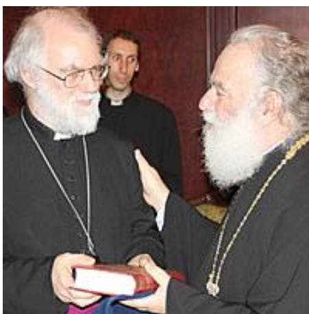
The Greek Orthodox Patriarch of Alexandria Theodoros II and the Archbishop of Canterbury, Rowan Williams (febr 2009).

He returned to his country and went on teaching the people to keep themselves in the orthodox faith, till the moment when it was convoked the council of the 318 bishops in the city of Niqya . He was one of them. He rebuked Aryos, excommunicated, cursed and expelled him. 4. When this Saint had finished fighting and defending his people, he emigrated to the Lord, having seated on the Episcopal throne more than forty years. All the days of his life are 80 years . That the Lord through his prayer be merciful on us. Amen. Amen.