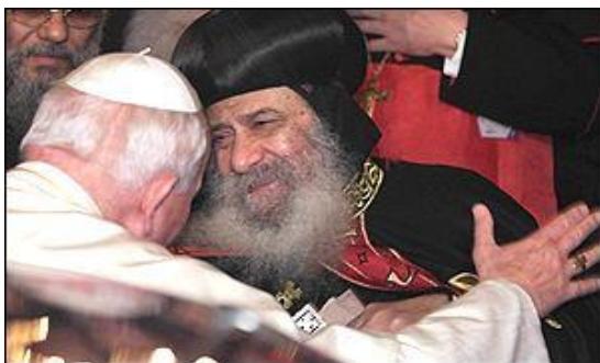
Pope John Paul II and Pope Shenuda III (Egypt, February 2000).

The Ethiopian Church is a branch of the Coptic Orthodox Church of Egypt that separated itself from the Byzantine and Roman Churches when the Chalcedonian Council (451) confessed in Christ two natures. This Monophysite Church has a strong feeling of the age of martyrs (till the persecution of Diocletian).