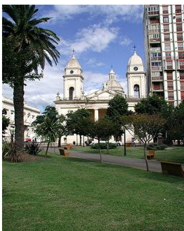
San Nicolás de los Arroyos