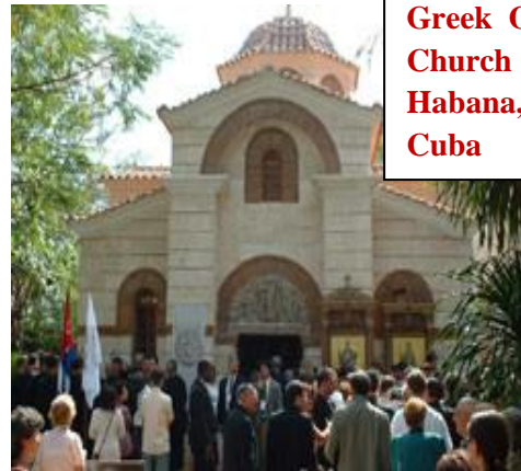
St Nicholas Greek Orth Church Habana, Cuba