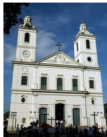
Church of St Nicholas in Rio Grande do Sul