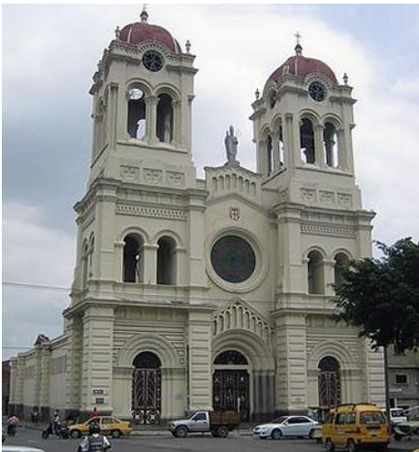
San Nicolás Cali, Valle del Cauca Colombia