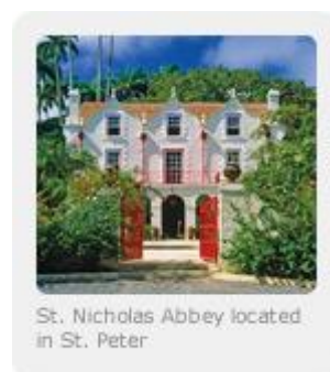
St Nicholas Abbey Barbados