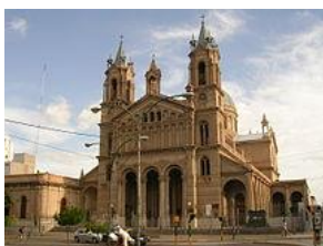
La Rioja St Nicholas Cathedral