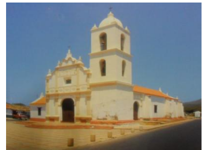
St Nicholas Church in Moruy (Paraguaná Peninsula) Falcón, Venezuela