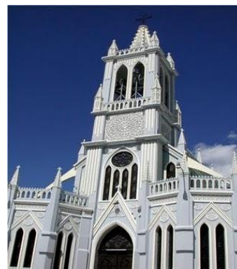
S Nicholas Church in Quetzalte- nango Guatemala